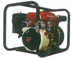
WL20XH DR 2"- diameter water pump