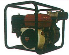
WL30XH DR 3"- diameter water pump